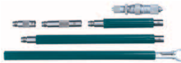
MICROMETER SET - M130